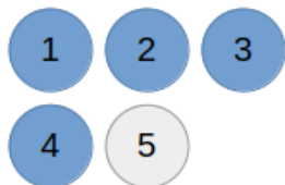
Figure 1: The other 4 pixels are used to find the value of the 5th.

Each pixel, as long as it is not on the top or side boundaries, will have 4 neighbors that have already been read into the machine. Those points can be analyzed and interpolated to find the next pixel's value. The goal is to encode the error between that value and the original value, save that, and use that to compress and decompress the image. Even though a possibly larger integer may need to be stored, it's more likely that the guess will be correct, or off by a small margin, making the distribution better for compression.